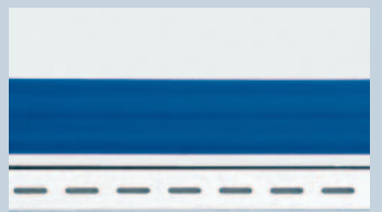
Water protection rail: Prevents water and dust from running below the cabinets