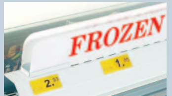
Product labelling and price tags: Product group signboards for easy clip on the cabinet covers