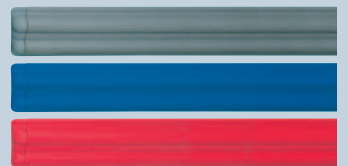
Impact protection bumpers: Available in different colours