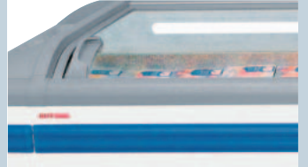
Internal light: For better visibility